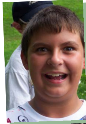
Hot Dogs and S'mores cooked over an open fire. YUM!

Today we focused on how we are saved to serve. In Jesus we have been saved from death to have life, and have it abundantly. I think God also saves us for the right time and place to serve. God might call you to serve sometime soon or later on. Since we know we are saved, I wonder for what God might be saving you? What do you think?