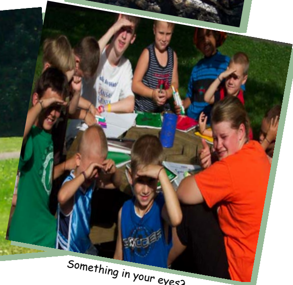
Something in your eyes?

Part of the experience at Hollis Crossings is large group games. Not only do the games burn off lots of energy, but de-emphasize winning and losing. Rather, the games emphasize playing hard, fair and safe.